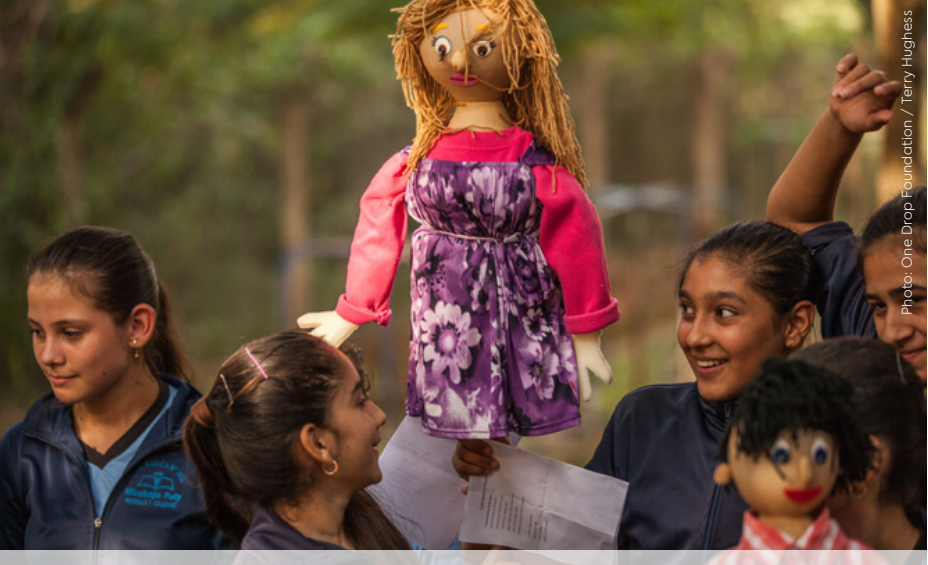
SABC workshop with students, participants of the Y Kuaa project in the Department of Paraguarí, Paraguay.

"One of my fondest memories the from workshops as an Agent of Change was when a facilitator coached US and instilled in us the of modulating habit our voice. (...) This has greatly helped me in my daily life, as I always participate (...) at the assembly and meetings I need to tap into that voice". - President of a Water User Committee in Nicaragua, participant in multiple activities speakina of an experience one or two years prior.