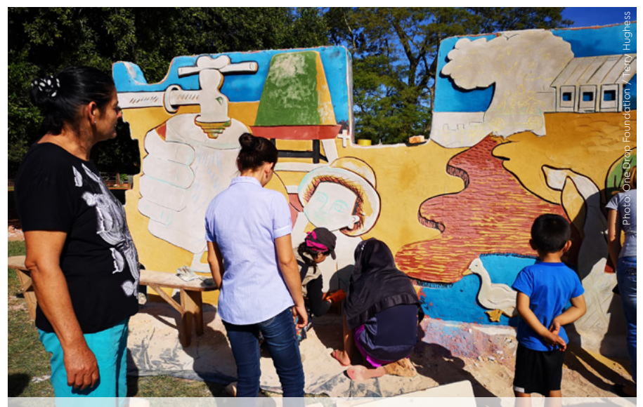
As part of an SABC process, Y Kuaa project participants and artists creating a mural in the Pegualjho community using sgrafitto technique.

Consequent findings from program monitoring revealed that 13% more people are practising handwashing with soap than when Lazos de Agua was first implemented. Better water coverage also influenced the onset of this behaviour, in addition to SABC interventions. 29% of interviewees also recognized that the change they perceived relates to empowerment, social cohesion, leadership, and/or artistic skill set: